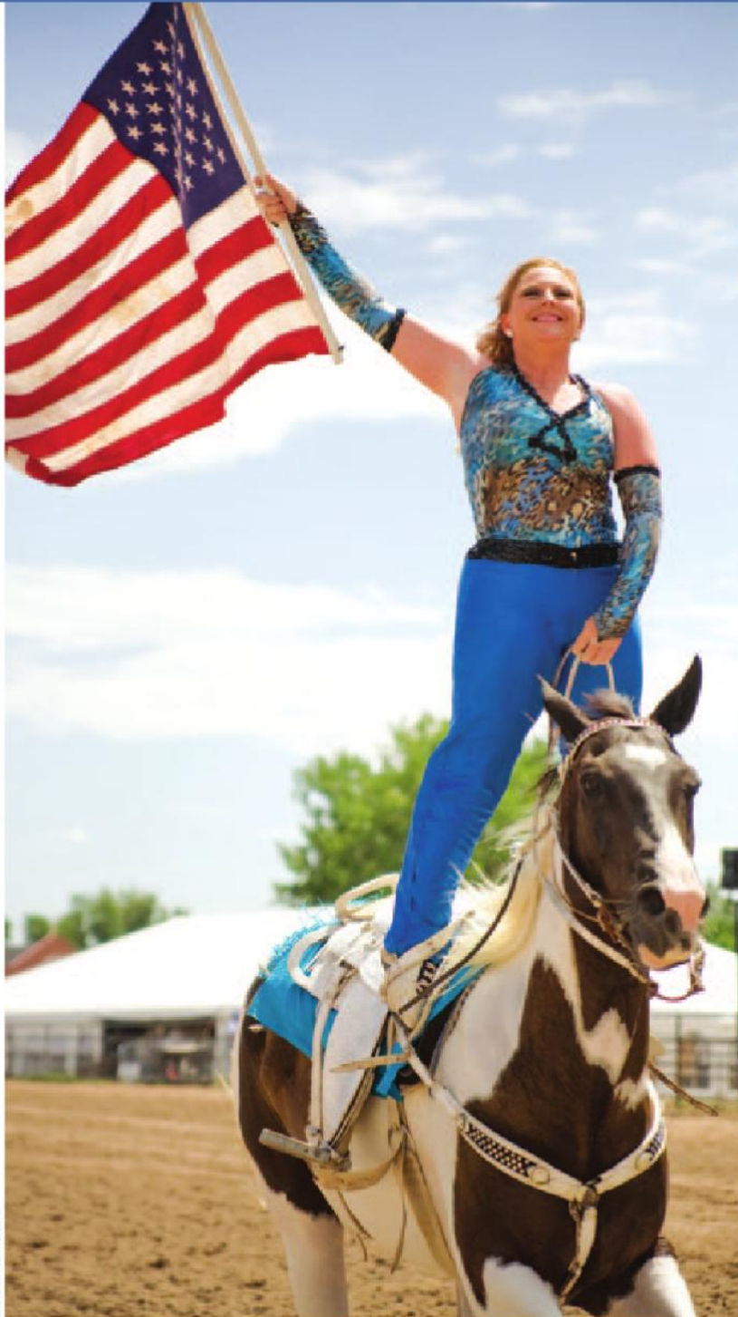
CHEYENNE FRONTIER DAYS